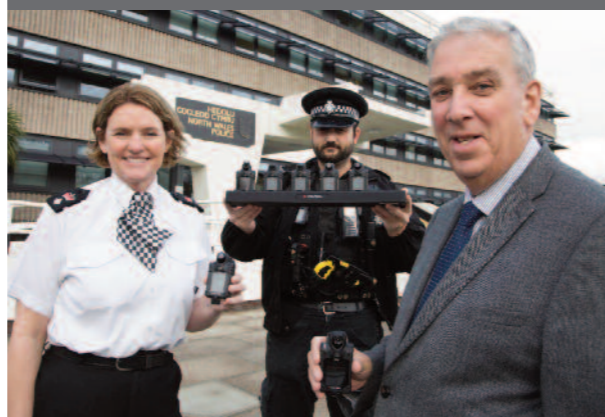
Buddsoddiad mewn offer fideo a wisgir ar y corff

Mae'r daflen hon yn dangos i chi faint o'ch treth cyngor sy'n cael ei wario ar blismona ac yn rhoi syniad i chi lle mae'r arian yn mynd. Am fwy o wybodaeth am gyllideb yr heddlu, ymwelwch â fy ngwefan: www.northwales-pcc.gov.uk