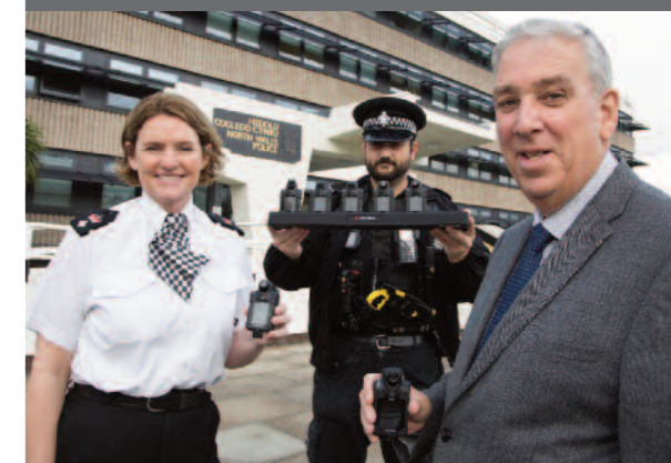
Body worn video investment

This leaflet gives a breakdown of how much of your council tax is spent on policing and an indication of where your money goes. For more information about the police budget, please visit my website: www.northwales-pcc.gov.uk