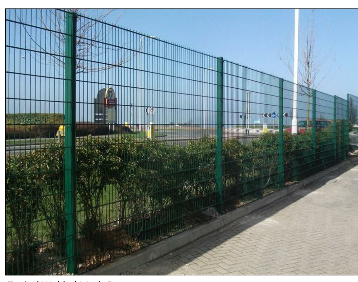
Typical Welded Mesh Fence