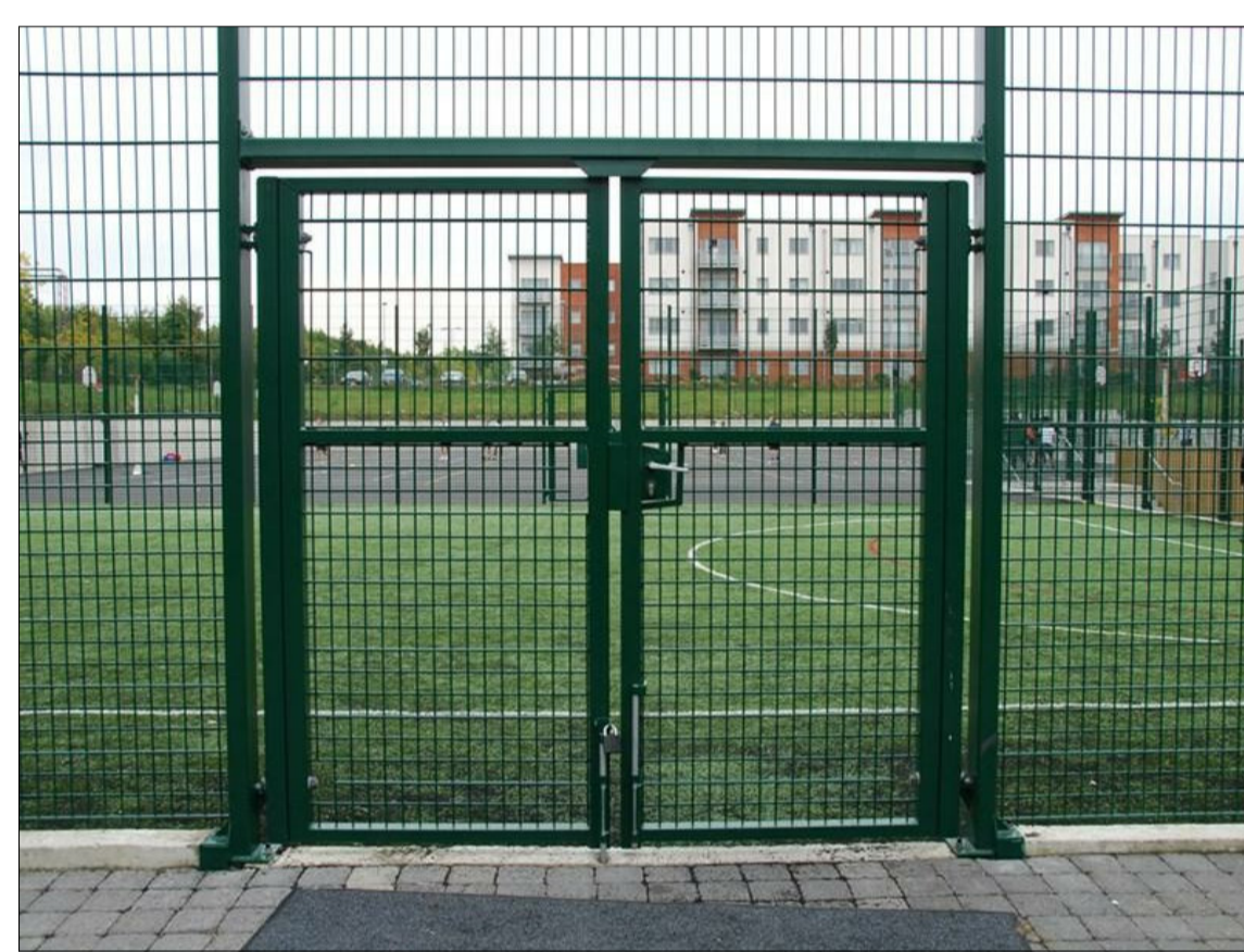
Typical Welded Mesh Gate