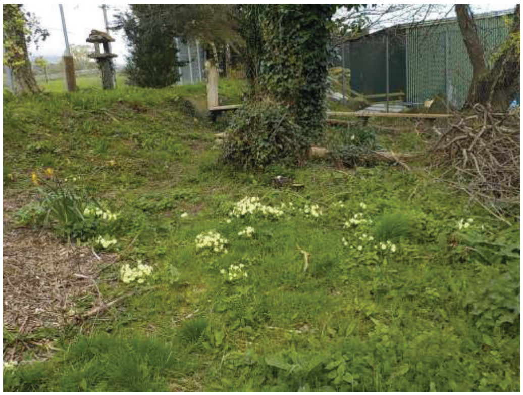
Small area of mixed woodland