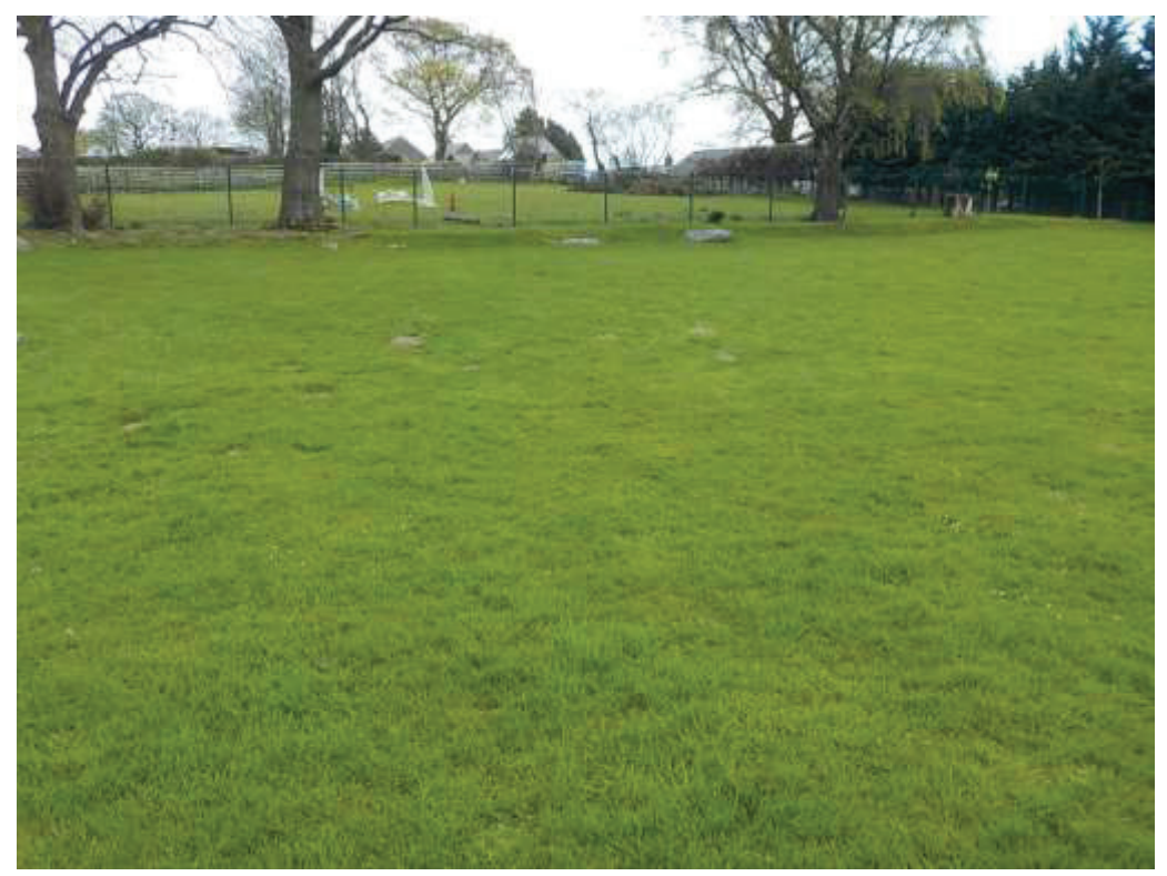
Amenity and improved grassland areas