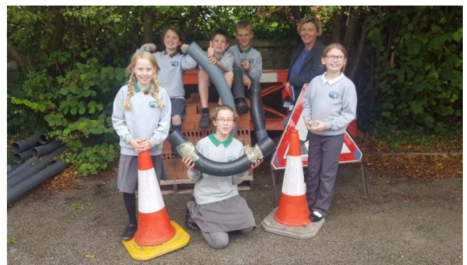
Above – Ysgol Llandrillo yn Rho getting ready to build.

Working in conjunction with Ysgol Llandrillo yn Rhos at nearby Rhos on Sea, B&K provided materials for a mini construction site which the school created for the pupils to learn more about the different materials involved in the building process and how they can be put together.