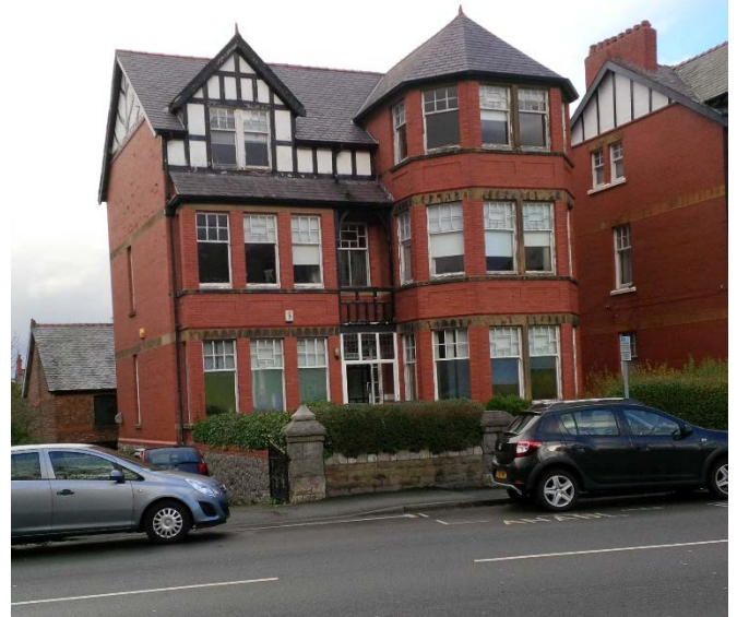
Above – 74 Conway Road, Colwyn Bay