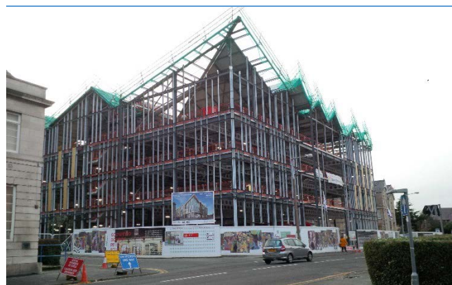
Above – ongoing works to the front elevation.

Branch, David Kelsall commented "The size of the development is impressive and the views from the upper floors across the Colwyn Bay skyline and beyond are breath taking. It will be a building which Conwy staff and Colwyn Bay should be proud of and a fantastic example of how property can be a catalyst for regeneration and operational change" .