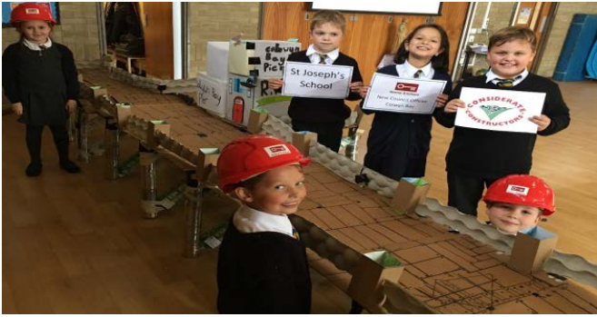
Above – Ysgol St Joseph's impressive Pier.

Build Competition, with the school's interpretation of Colwyn Bay Pier!