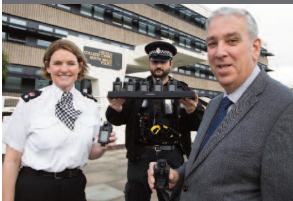
Buddsoddiad mewn offer fideo a wisgir ar y corff

Mae'r daflen hon yn dangos i chi faint o'ch treth cyngor sy'n cael ei wario ar blismona ac yn rhoi syniad i chi lle mae'r arian yn mynd. Am fwy o wybodaeth am gyllideb yr heddlu, ymwelwch â fy ngwefan: www.northwales-pcc.gov.uk