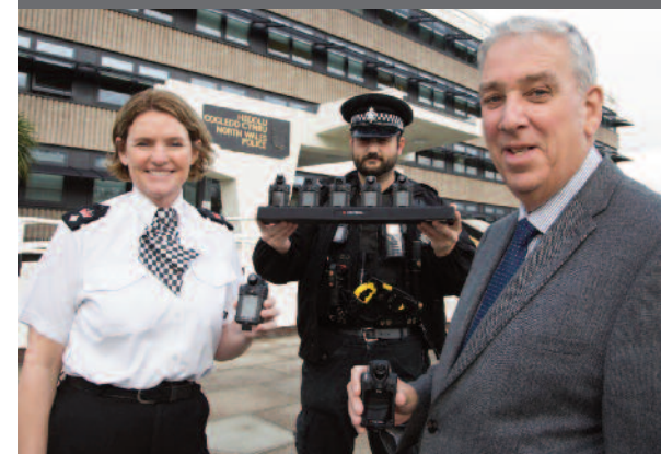
Body worn video investment

This leaflet gives a breakdown of how much of your council tax is spent on policing and an indication of where your money goes. For more information about the police budget, please visit my website: www.northwales-pcc.gov.uk