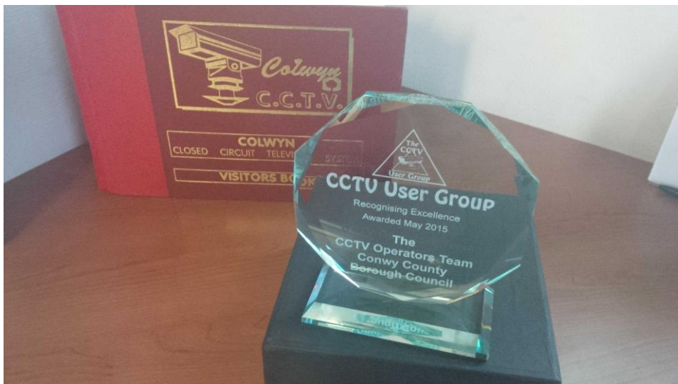
© CCTV Team of the Year 'Recognising Excellence' Award