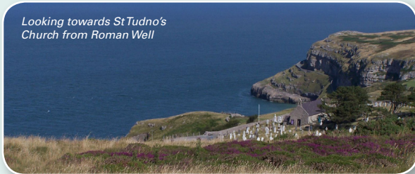
Looking towards St Tudno's Church from Roman Well

Now continue along the track in front of you. Walk around the gate on the track and continue to Stop 8.