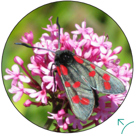
Six spot burnet moth