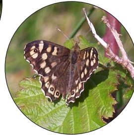
Speckled wood butterfly