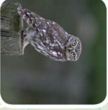
07 y dyluan fach little owl