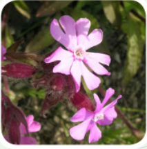
01 blodyn neidr red campion