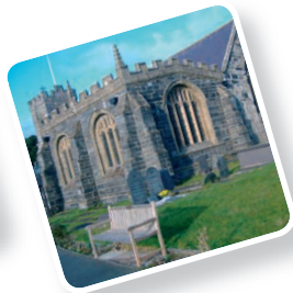
St. Grwst's Church