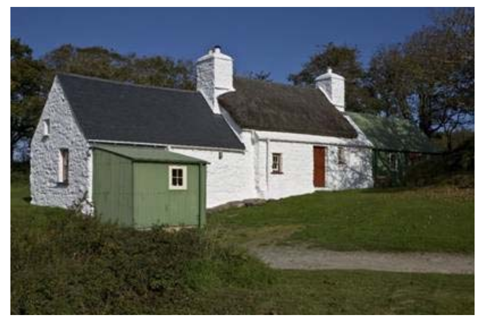
Figure 3 -Yr Hen Siop, Tretio.