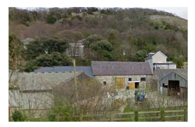
Figure 6 – Marl Farm, Marl Lane, Llandudno Junction. Conversion of outbuildings into four dwellings.