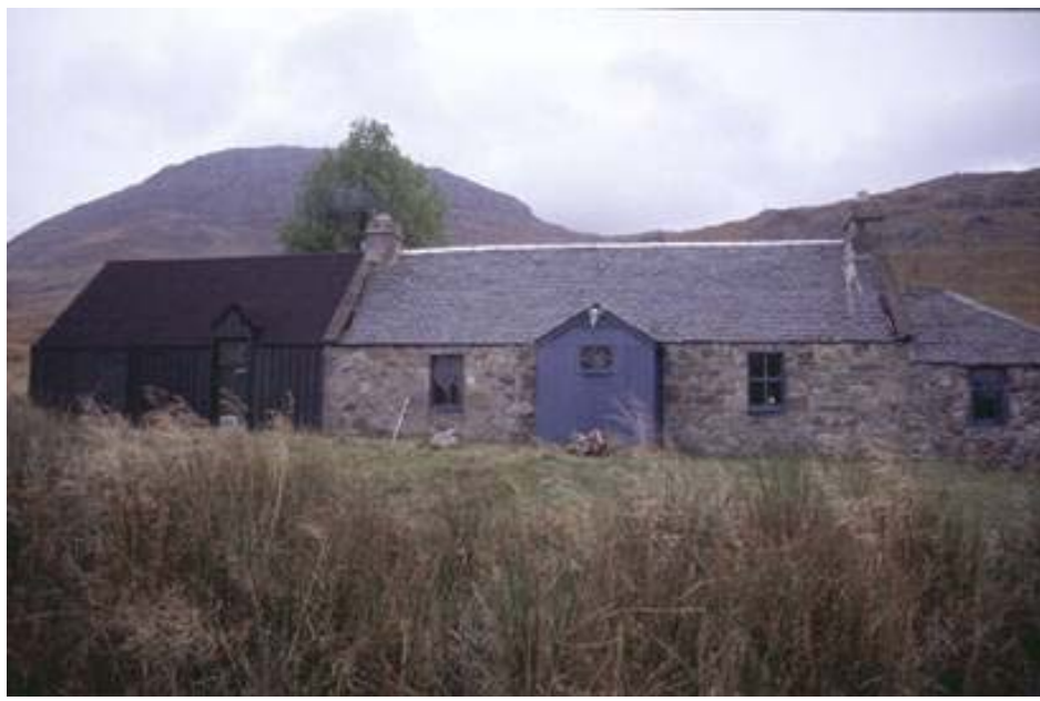
Figure 4 Ben Alder Cottage in the Highlands Example of an extension which was clad in corrugated black tin.