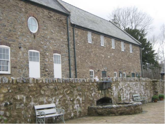
Figure 1 – Bodnant Food Centre (Highly commended in the 2013 Royal Town Planning institute Wales Planning Award). Renovation of garden centre buildings with associated ancillary activities. The existing buildings were fully repaired with the removal of existing render (in poor condition), to re-expose original random stone wall. The existing roof was removed and raised, to allow for expansion to the existing mezzanine and upper floors. The scheme improves the run of ad hoc structures and was supported so as to safeguard the existing employment opportunities.