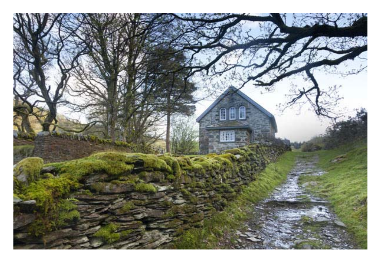
Figure 5 –Ty Capel, Rhiwddolion, Betws y Coed (Landmark Trust) <a href="http://www.landmarktrust.org.uk/our-landmarks/properties/ty-capel-12658">http://www.landmarktrust.org.uk/our-landmarks/properties/ty-capel-12658</a>