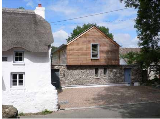
Figure 2 – The Nook, Oxwich (further information on the Design Commission for Wales website <a href="http://dcfw.org/the-nook-oxwich">http://dcfw.org/the-nook-oxwich</a>)