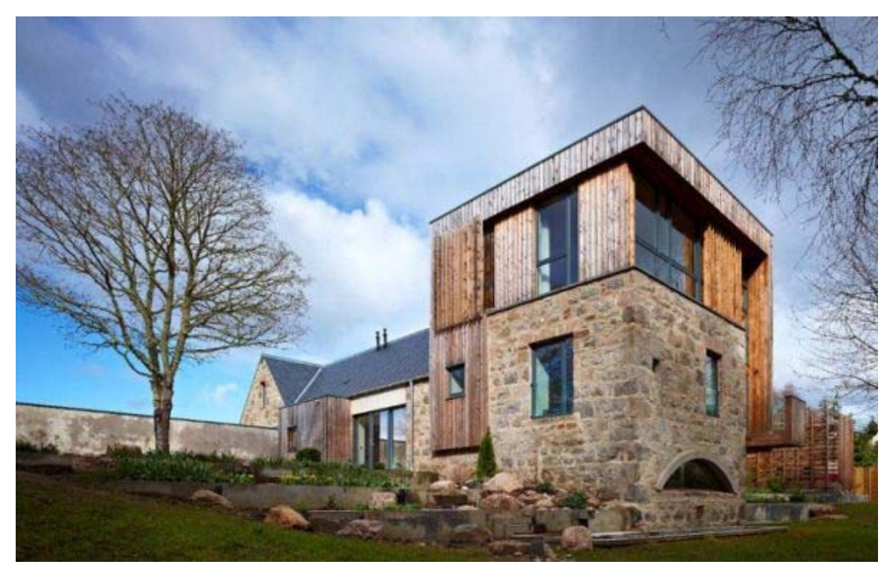
Figure 8 - Bogbain Mill project in Dingwall <a href="http://www.ruraldesign.co.uk/#Bogbain-Mill">http://www.ruraldesign.co.uk/#Bogbain-Mill</a> <a href="http://www.scotland.gov.uk/Topics/Built-Environment/AandP/InspirationalDesigns/ProjectType/Conversionrural/BogbainMill">http://www.scotland.gov.uk/Topics/Built-Environment/AandP/InspirationalDesigns/ProjectType/Conversionrural/BogbainMill</a>