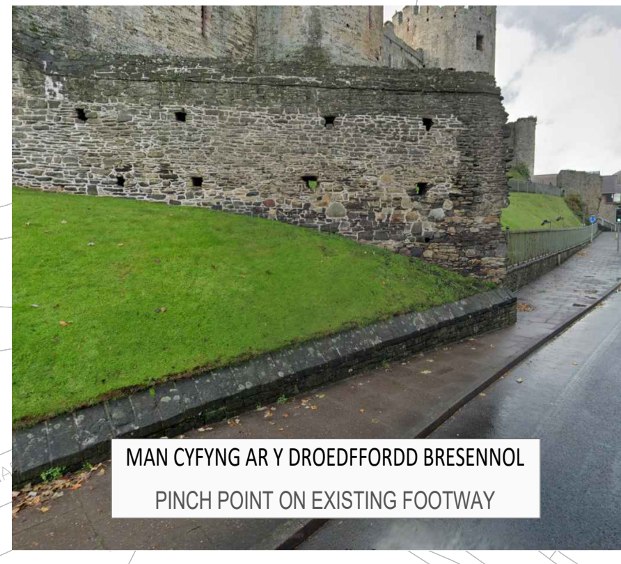
MAN CYFYNG AR Y DROEDFFORDD BRESENOL PINCH POINT ON EXISTING FOOTWAY