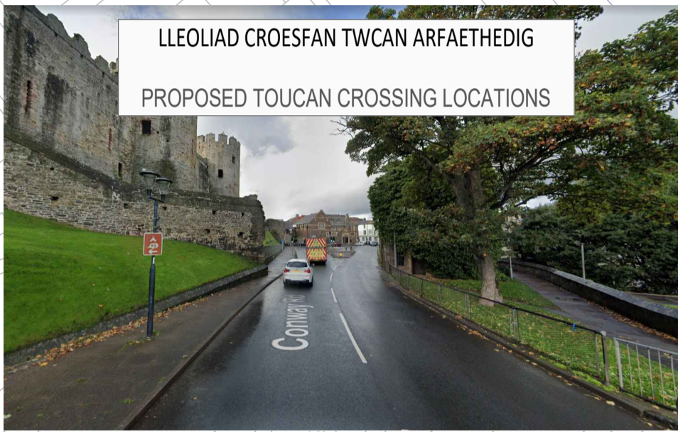
LLEOLIAD CROESFAN TWCAN ARFAETHEDIG PROPOSED TOUCAN CROSSING LOCATIONS

GWAREDU'R WAL GERRIG BRESENOL A CHREU MAN CROESI TWCAN ER MWYNI GERDDWYR A BEICWYR GAEL MYNEDIAD I'R BONT GROG EXISTING STONE WALL TO BE REMOVED FOR TOUCAN CROSSING POINT FOR PEDESTRIANS & CYCLISTS TO ACCESS SUSPENSION BRIDGE