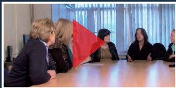
NEW WORK CONNECTIONS www.bit.ly/nwconnect

The North Wales Specialist European Team has published a series of Europe and North Wales videos which looks at the effects of 2007-13 European Structural Funding on the businesses, communities and people of North Wales.