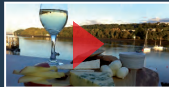
LOCAL INVESTMENT FUND http://bit.ly/lifnwww