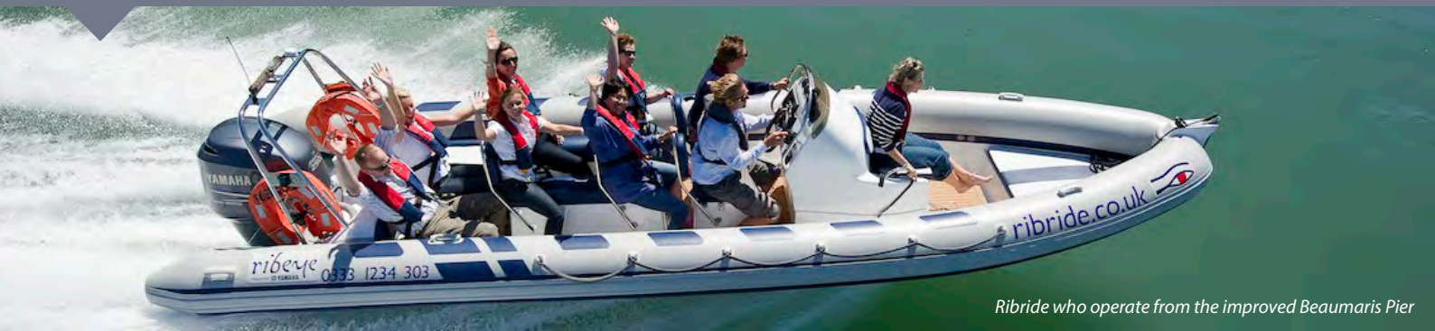
Ribride who operate from the improved Beaumaris Pier