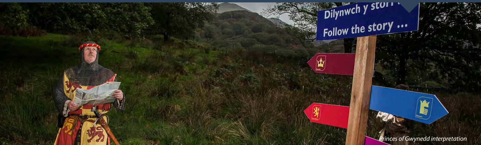
Princes of Gwynedd interpretation

The refurbishment of Beaumaris Pier, part of the EU funded Anglesey Coastal Environment project, is an example of how this work can have a knock-on effect on the wider economy. The work enabled businesses such as adventure boat ride specialists Rib Ride to operate from Beaumaris and attract more people into the town.