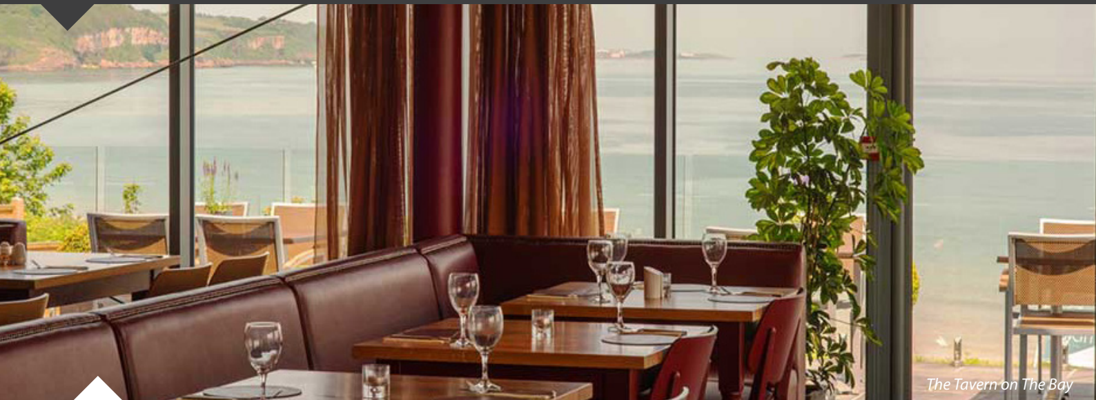
The Tavern on The Bay