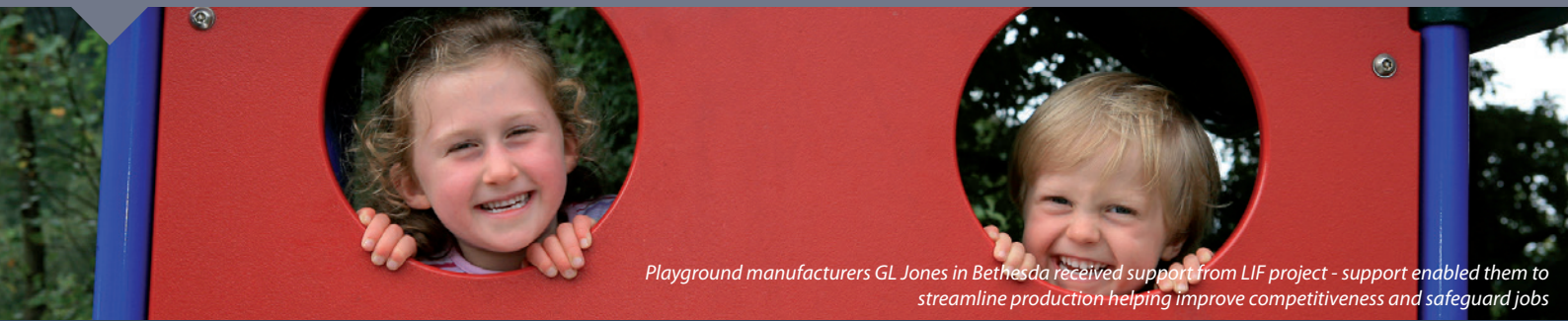
Playground manufacturers GL Jones in Bethesda received support from LIF project - support enabled them to streamline production helping improve competitiveness and safeguard jobs