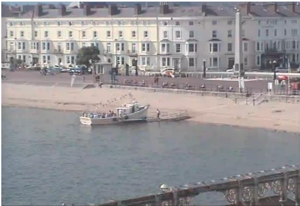
© Llandudno Bay taken from CCTV Camera near Grand Hotel