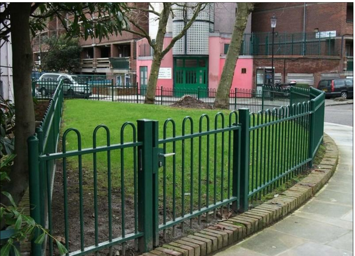
Typical Loop Top Gate