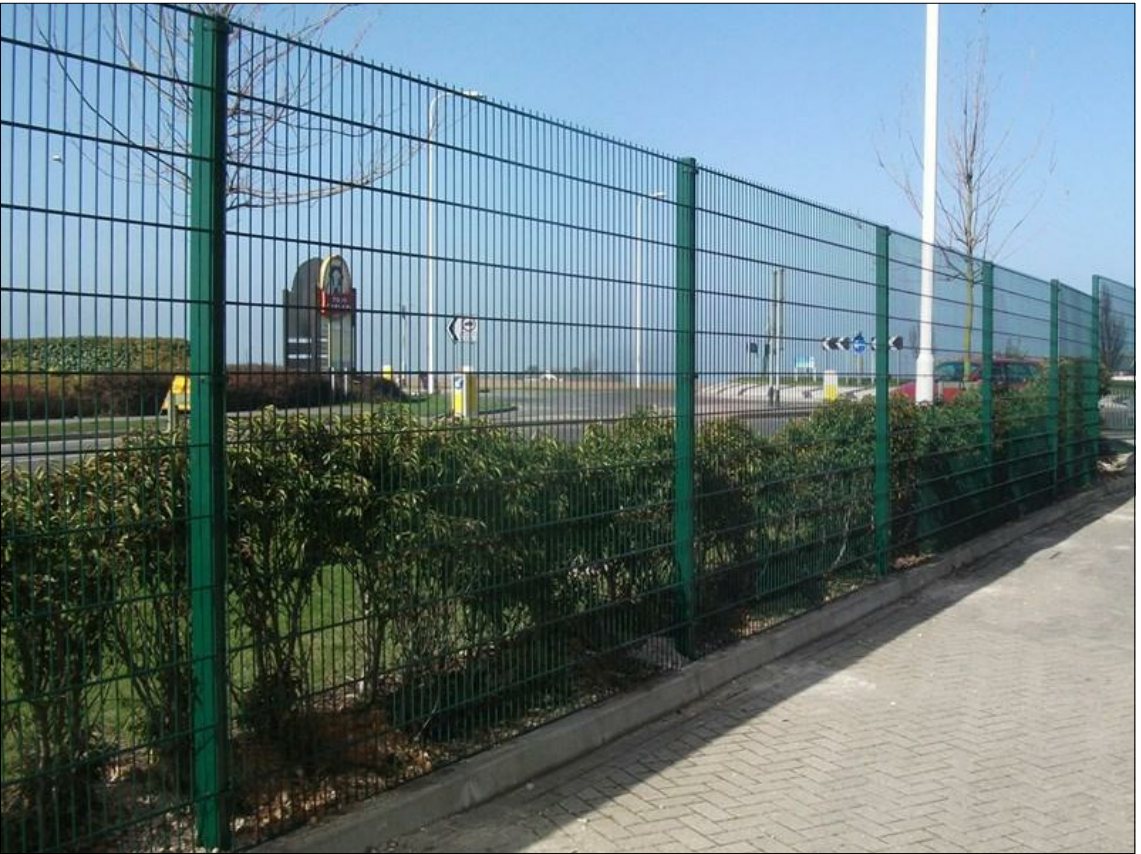
Typical Welded Mesh Fence