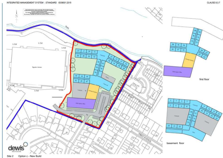
Image: indicative purposes only. The development is still subject to formal design and planning permission.

Recommendation: to remove the site from the green wedge but with requirement for suitable design of the new building with careful consideration on massing and height.