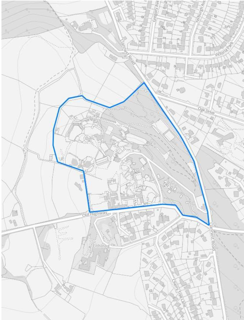
Above: Welsh Mountain Zoo. Proposed area to remove from the Green Wedge.

Recommendation: It is intended to remove the main part of the site from within the Green Wedge in line with the plan below.